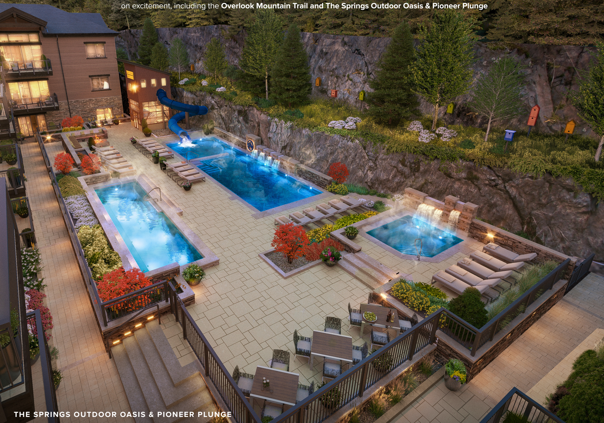
THE SPRINGS OUTDOOR OASIS & PIONEER PLUNGE

Frontgate | Avon will feature an adventurous myriad of signature amenities throughout the property with an emphasis on excitement, including the Overlook Mountain Trail and The Springs Outdoor Oasis & Pioneer Plunge