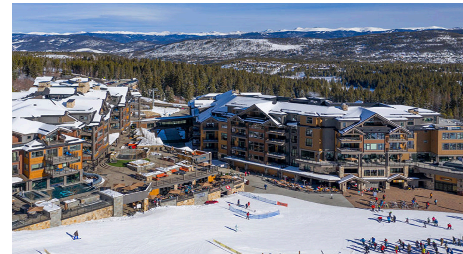
Grand Colorado on Peak 8 — Breckenridge, CO