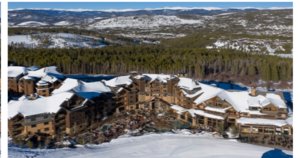
Grand Lodge on Peak 7 — Breckenridge, CO